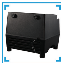
Unique rubber foot shock proof design, soundproof cover easy to disassemble.