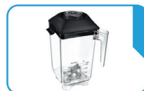
Unbreakable jar. BPA free.