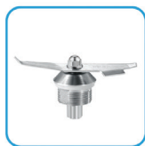
Large straight blade with special angles, ice breaking rapidly.