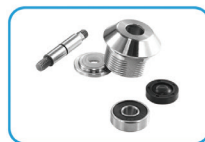
Patent double s/s bearings. waterproof bearings house.