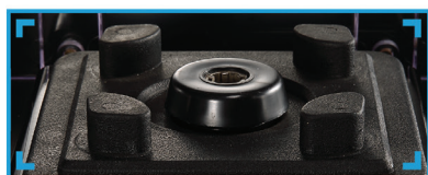
Aluminum alloy motor seat, automatical balance finding connector.