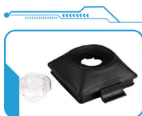
Unique jar cover, anti spray leak proof.

That's why we offer you 2 years warranty.